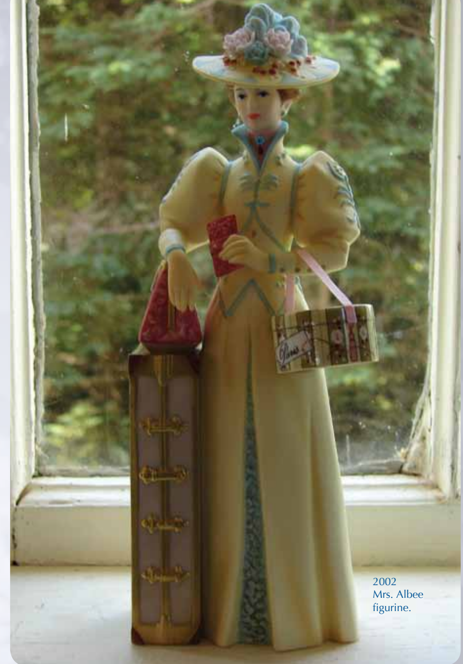
2002 Mrs. Albee figurine.

Although many of the figurines were produced in Japan, Taiwan, China, and Malaysia, Avon commissioned the Spanish company Bondia to create a