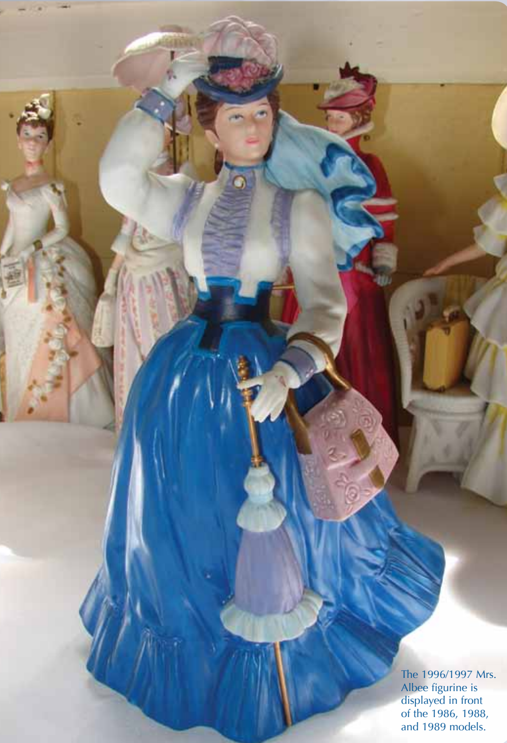
The 1996/1997 Mrs. Albee figurine is displayed in front of the 1986, 1988, and 1989 models.