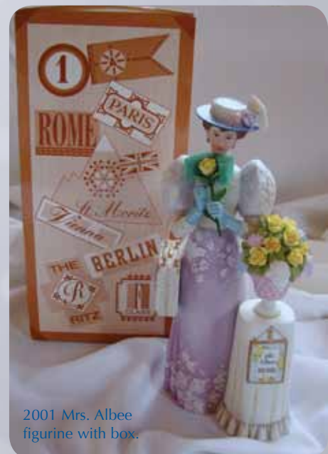
2001 Mrs. Albee figurine with box.

In 2008, the National Special Events Registry officially designated December 7th (Albee’s birthday) as The First Avon Lady Day . Albee’s contribution to American history and commerce is also honored by the New Hampshire Historical Society, which has created a Mrs. P. F. E. Albee room at the Sheridan House Museum in Winchester, N.H. The room of Avon memorabilia was dedicated June 1st, 2008. ♦